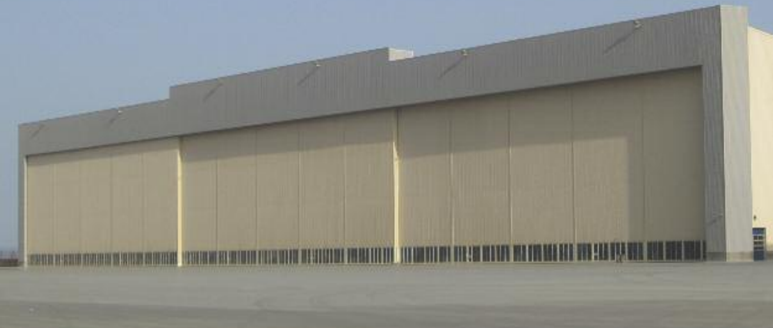
The Amiri Flight hangar at New Doha International Airport has two sets of Esavian Type 126 doors installed with a total width of 310 metres