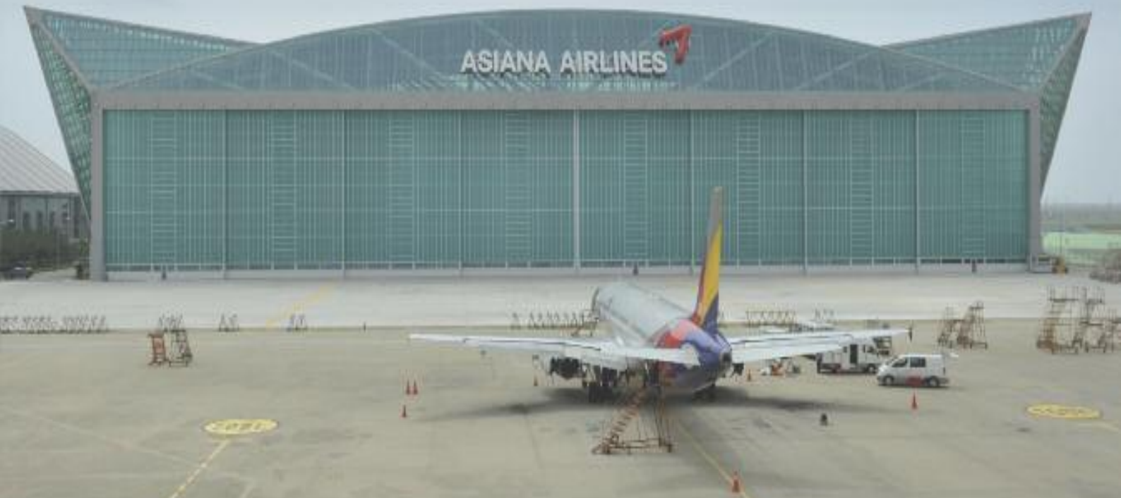
Asiana Airlines MRO facility at Incheon International Airport

Installed on more A380 and B747 hangars worldwide than any other door system.