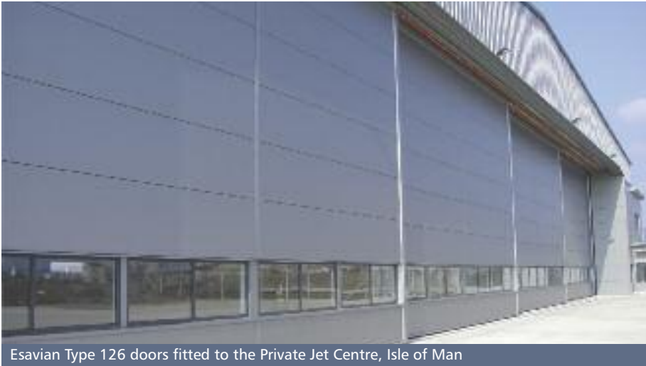
Esavian Type 126 doors fitted to the Private Jet Centre, Isle of Man

Esavian sliding and folding doors are in service on every continent and in more than 40 countries. They are the most advanced hangar door system in the world and remain the premium choice for commercial airlines, military, MROs, FBOs and royalty.