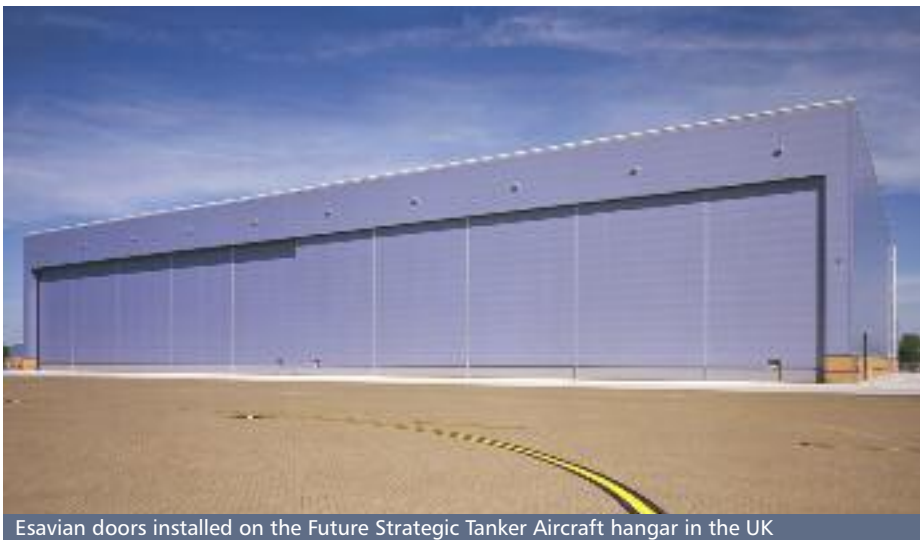
Esavian doors installed on the Future Strategic Tanker Aircraft hangar in the UK