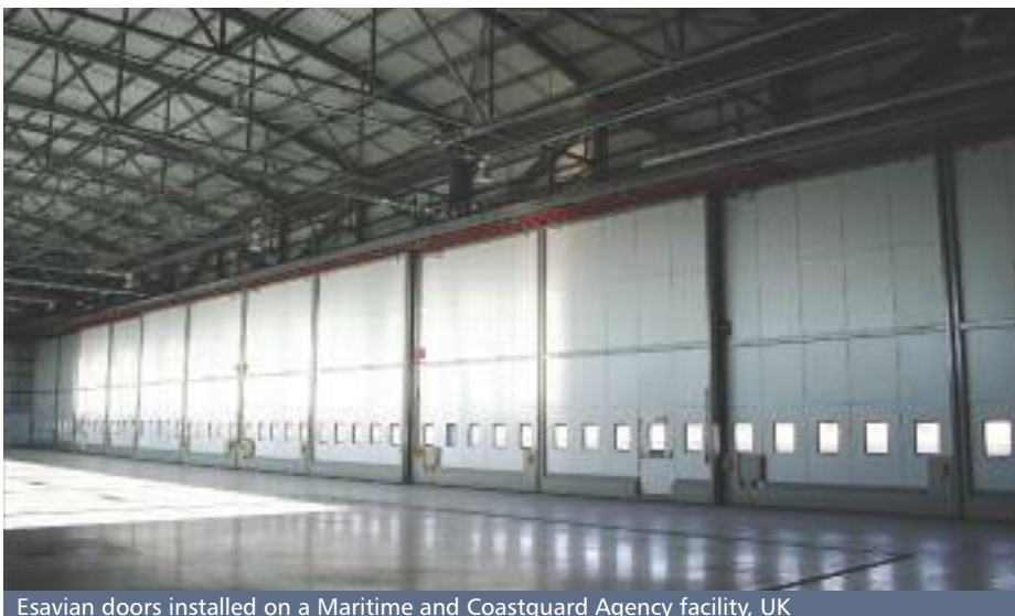
Esavian doors installed on a Maritime and Coastguard Agency facility, UK