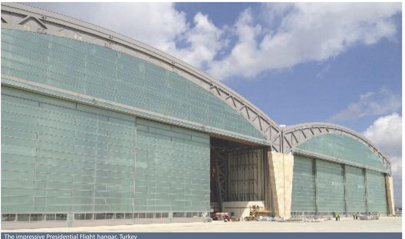
The impressive Presidential Flight hangar, Turkey