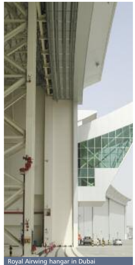
Royal Airwing hangar in Dubai